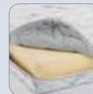
REMOVABLE AND WASHABLE.