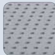
AIRYFORM 3 ZONES.

During the designing of this mattress, we verified how the tension of a body that sleeps on Memoform, is already reduced by 14% in the first 30 minutes. This is due to the Memoform Magnifoam structure, that, with its capacity to adapt according to the pressure exercised, fills the “empty” spaces created by the body’s silhouette comfortably supporting the bone structure and, in particular, the areas subject to muscular and posture aches. The Airyform structure distributes the weight in 3 zones on the length of the mattress and so can support differently the head, trunk and legs. The Airyform canals optimize the thermal action of the Coolmax covering.