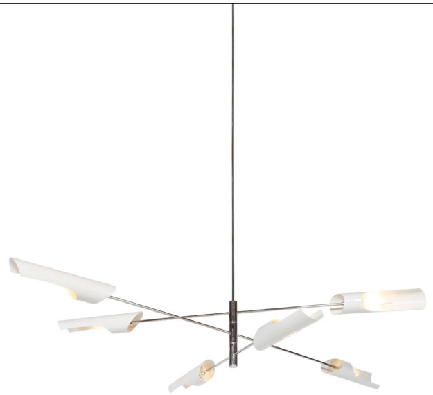
Shown above with three tiers