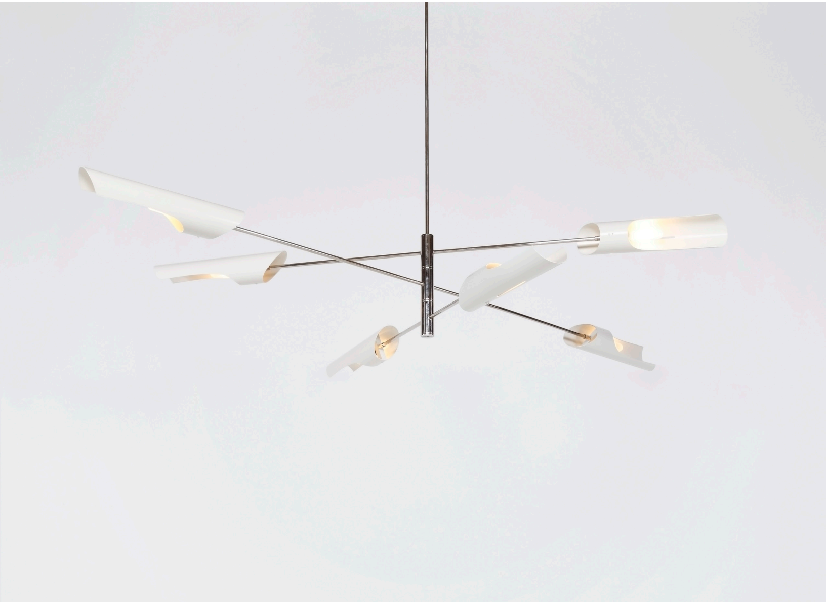
Classic. Modern. The Torroja Cross Chandelier from David Weeks Studio.